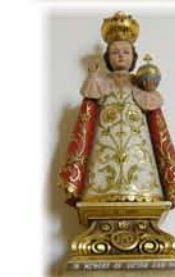
Infant of Prague

SAINT MICHAEL the ARCHANGEL September 29 Patron of police, paratroopers, mariners, grocers, those battling illness. His name means "who is like to God?" Scripture describes him as leader of the forces of heaven in triumph over the powers of evil.