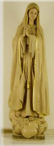
Our Lady of Fatima